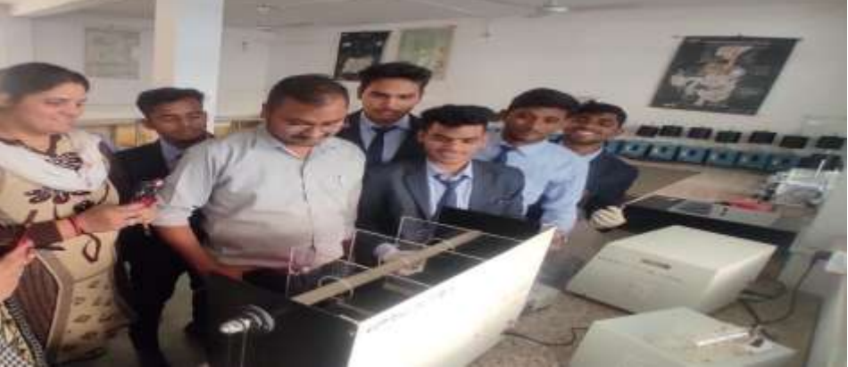
Fig. Muscle relxant activity of Extract shown at the dose of anticonvulsant activity