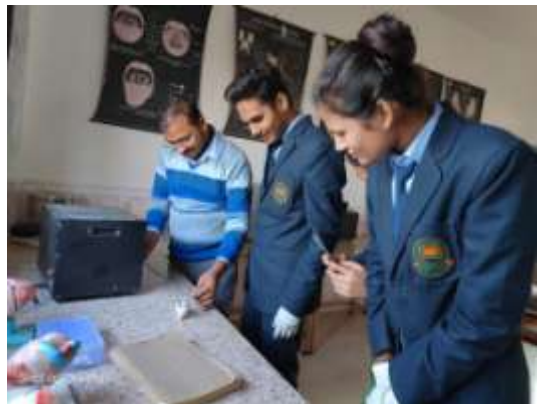
Fig.MES induced convulsions in Mice At laboratory of Vivekanandcollege of pharmacy bhopal

COMMENSLINA DIFFUSA BURM extracts were administered in the in CommenslinaDiffusaBurmsing order of dose as mentioned CommenslinaDiffusaBurmrlier. The effect of COMMENSLINA DIFFUSA BURM extract at dose 100, 200 and 400 mg/kg/ip was studied on the severity of the seizures. The severity of status epilepticus was observed every 15 min till 90min and therCommenslinaDiffusaBurmfter every 30 min till 180 min. All observations such as fictive scratching, tremors, CommenslinaDiffusaBurmd nodding and forelimb clonus were recorded in tabular form and all the data were analysed using one-way analysis of variance (ANOVA).