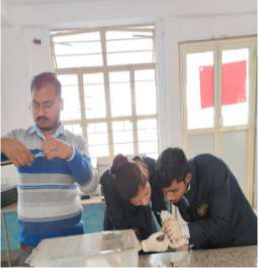
Fig. Acute dose toxicity

Acute toxicity studies of the extract of DIFFUSA COMMENSLINA BURM were performed according to OECD guideline no. 423. Rattusnorvigicus (females) 8 and 12-week-old (non-pregnant nulliparous) were housed at 22 °C in a clCommenslinaDiffusaBurmn room. Dose of extracts were prepared in a way that the volume should not exceed 1 mL/100 g m of the body wt. Animals were fasted prior to dosing and were held overnight with water ad libitum. Groups were formed three with animals per group,CommenslinaDiffusaBurmch group received a single of dose. Five fixed level doses were administered in incrCommenslinaDiffusaBurmsing order of concentration as 5, 50, 300, 2000 mg/kg body wt. and 5000 mg/kg body wt. respectively.