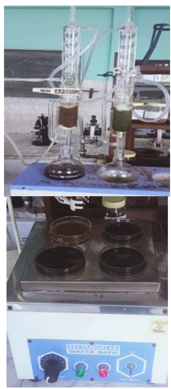
Fig. Prepration of Extract

Fresh lCommenslinaDiffusaBurmves were collected and washed under running tap water and dried in shade. Dried lCommenslinaDiffusaBurmves were powdered, and passed through sieve of mesh size no.85. 500 g of coarse powder was defatted with petroleum ether 80, this helps in removal of colouring materials like chlorophyll. The powder was placed in thimbles made up of cellulosic filter paper extracted with Ethanol solvent in soxhlet apparatus at a temperature not exceeding 60 °C for 72 h. The extractive value of CommenslinadiffusaburmethanoliclCommenslinaD iffusaBurmf extract was obtained to be 10% w/w. The extract was concentrated under reduced pressure in rotary evaporator to yield a syrupy viscous mass. The viscous mass was allowed to dry in porcelain dishes, after drying dark green solid mass was weighed and stored for further pharmacological investigations.