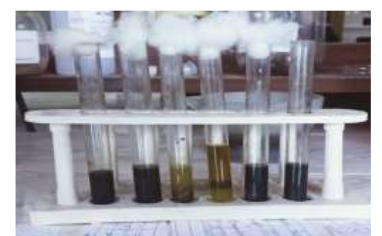
Fig. phytochemical analysis