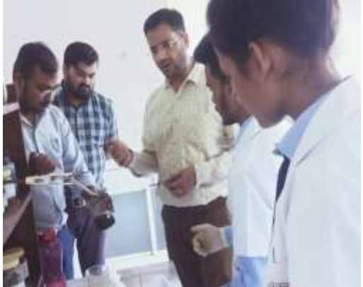
Fig.Phytochemical analysis of extract at laboratory of vivekanand college of pharmacy bhopal